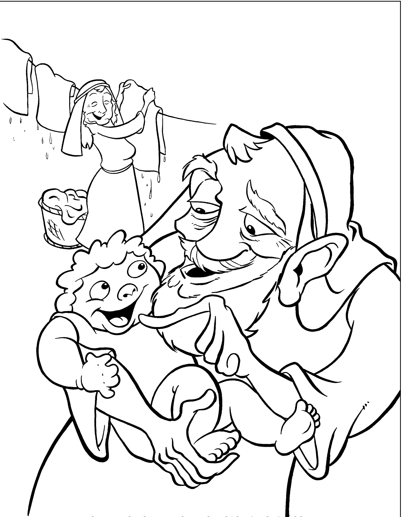
God gave Abraham and Sarah a baby in their old age. They named him Isaac (Gen. 21:1-7).