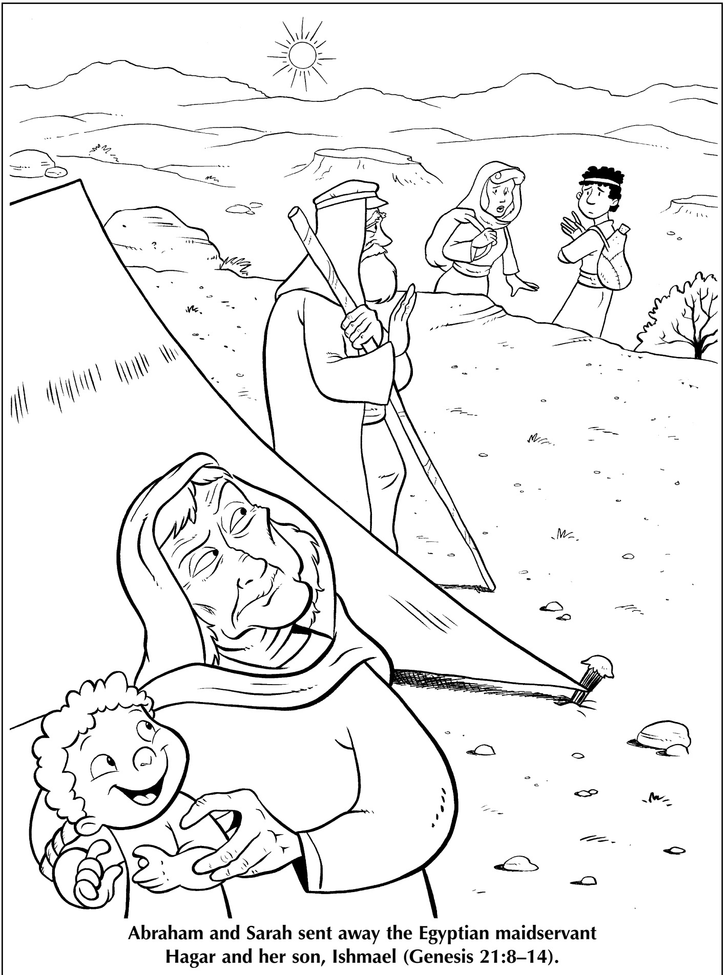
Abraham and Sarah sent away the Egyptian maidservant Hagar and her son, Ishmael (Genesis 21:8–14).