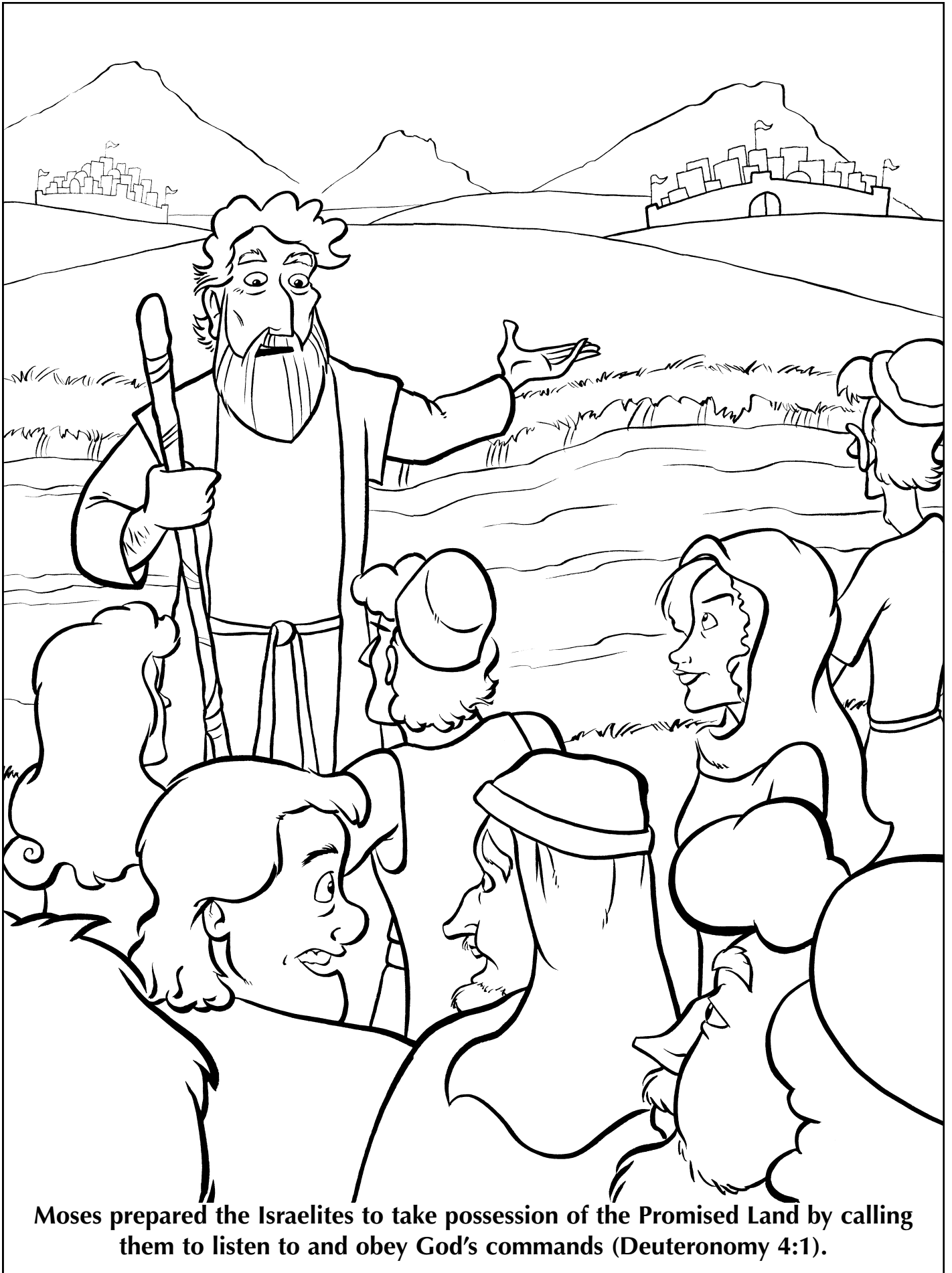
Moses prepared the Israelites to take possession of the Promised Land by calling them to listen to and obey God's commands (Deuteronomy 4:1).