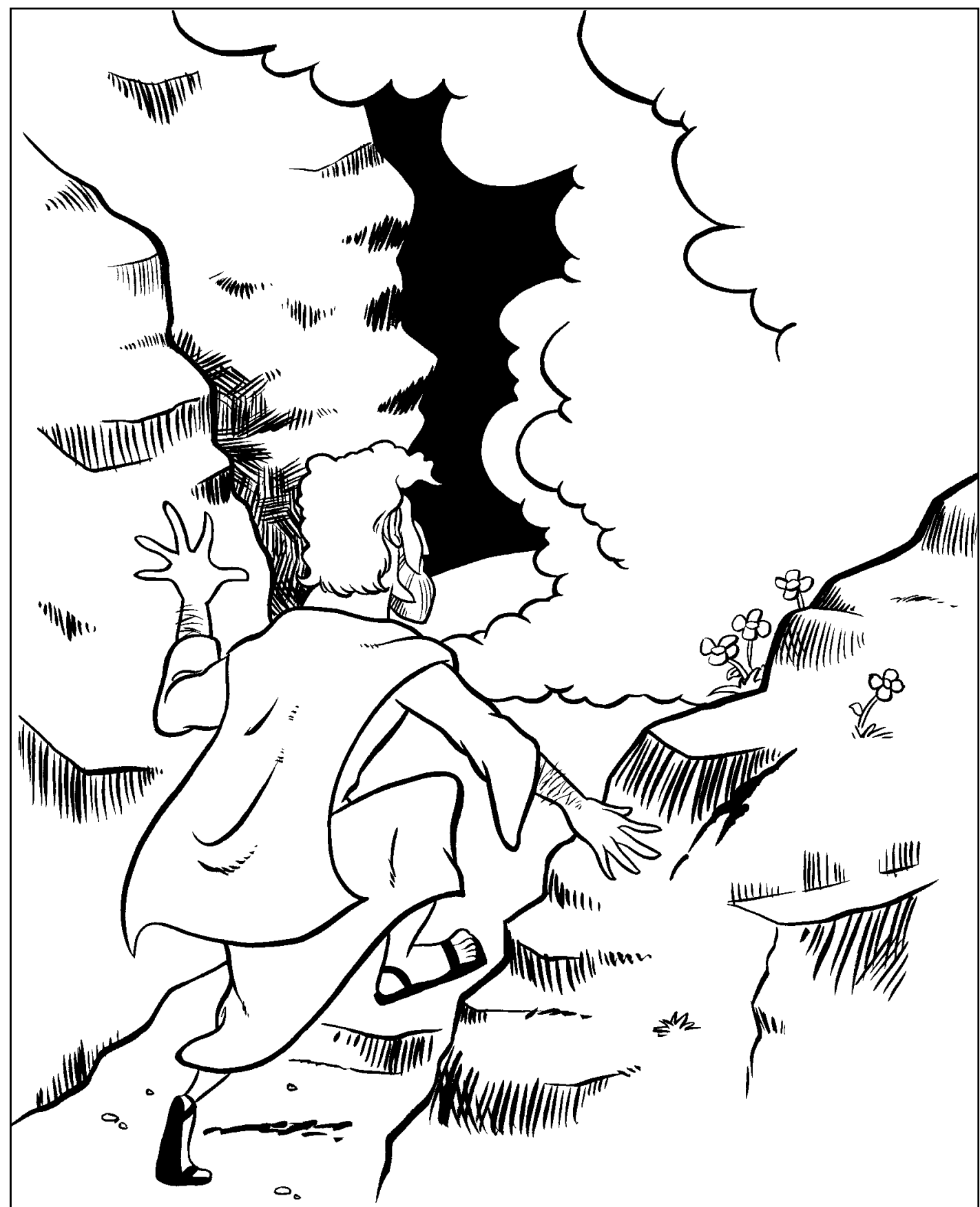
"And the LORD said to Moses, 'Behold, I come to you in the thick cloud, that the people may hear when I speak with you, and believe you forever'" (Exodus 19:9).